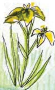
Yellow flag iris* Iris pseudacorus