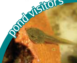
Tadpole (common frog)