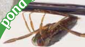
Water boatman