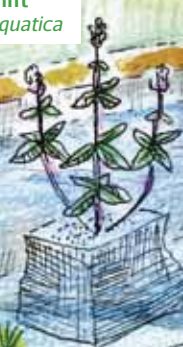
Water mint Mentha aquatica